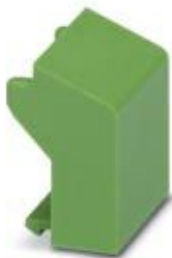
DIN rail housing, Filler plug for unoccupied terminal points, color: green (6021)

Please be informed that the data shown in this PDF Document is generated from our Online Catalog. Please find the complete data in the user's documentation. Our General Terms of Use for Downloads are valid ( http://phoenixcontact.com/download )