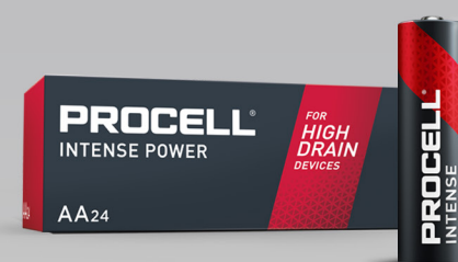
PROCELL INTENSE POWER ALKALINE AA 24CT [ PX1500 ]