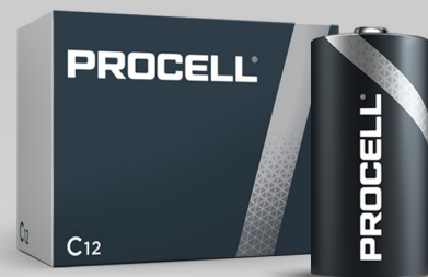
PROCELL ALKALINE C 12CT [ PC1400 ]