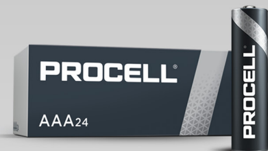
PROCELL ALKALINE AAA 24CT [ PC2400 ]