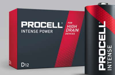
PROCELL INTENSE POWER ALKALINE D 12CT [ PX1300 ]