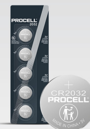
PROCELL LITHIUM COIN 2032 5CT [ PC2032 ]