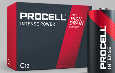
PROCELL INTENSE POWER ALKALINE C 12CT [ PX1400 ]