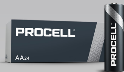
PROCELL ALKALINE AA 24CT [ PC1500 ]