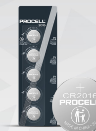
PROCELL LITHIUM COIN 2016 5CT [ PC2016 ]

*Procell Intense Power and Procell Lithium ranges will be available from November 2019