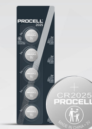
PROCELL LITHIUM COIN 2025 5CT [ PC2025 ]