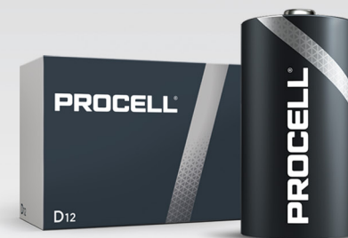
PROCELL ALKALINE D 12CT [ PC1300 ]