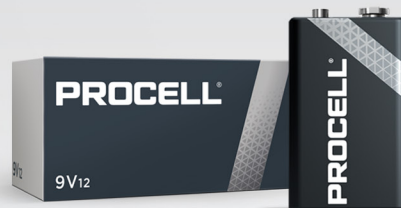
PROCELL ALKALINE 9V 12CT [ PC1604 ]