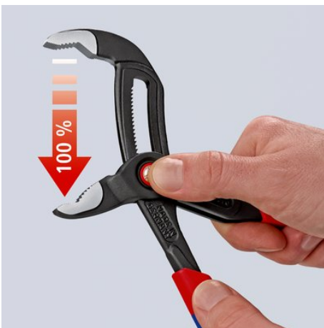
Press the button – open pliers completely