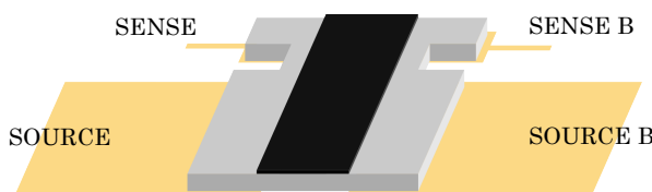
Figure 2. Connections Using Mounted Patterns