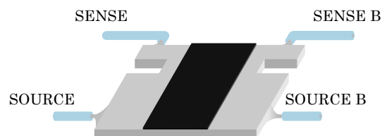
Figure 3. Connections Using Lead Wires