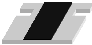
Figure 1. Shunt Resistor Shape

The resistance temperature coefficient of a shunt resistor such as that shown in Figure 1 was measured using the two methods illustrated in Figures 2 and 3. In Figure 2, the necessary connections have been made using pattern wiring with the land profile recommended for the component, while in Figure 3, the connections are made with lead wires. The measurement shown in Figure 2 yielded a temperature coefficient of -46.8 \text{ ppm}/^{\circ}\text{C} , while the measurement shown in Figure 3 yielded a temperature coefficient of -421 \text{ ppm}/^{\circ}\text{C} —nine times higher than the value obtained for the mounted approach. These results suggest that application of current from fine probes, for example during component testing, has an adverse impact on the temperature coefficient.