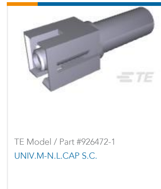
TE Model / Part #926472-1 UNIV.M-N.L.CAP S.C.