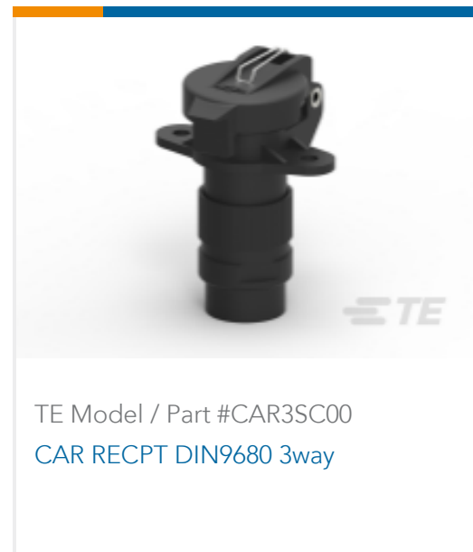
TE Model / Part #CAR3SC00 CAR RECPT DIN9680 3way