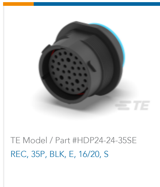
TE Model / Part #HDP24-24-35SE REC, 35P, BLK, E, 16/20, S