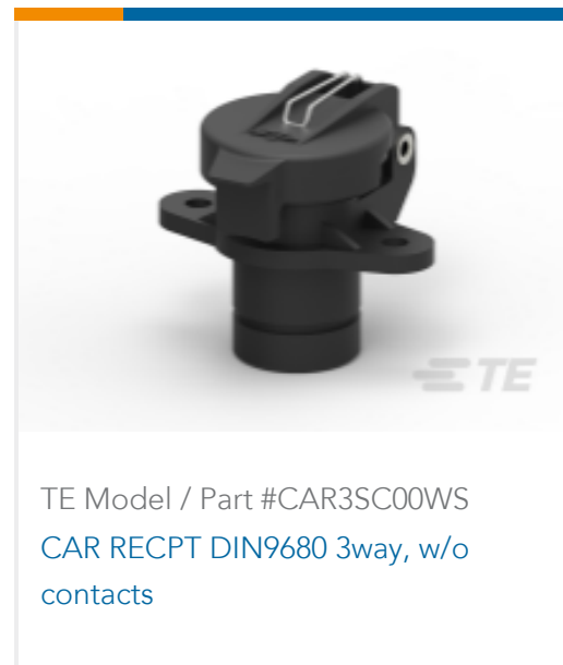
TE Model / Part #CAR3SC00WS CAR RECPT DIN9680 3way, w/o contacts