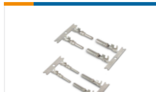
TE Model / Part #1062-16-0177 DEUTSCH STAMPED & FORMED CONTACTS