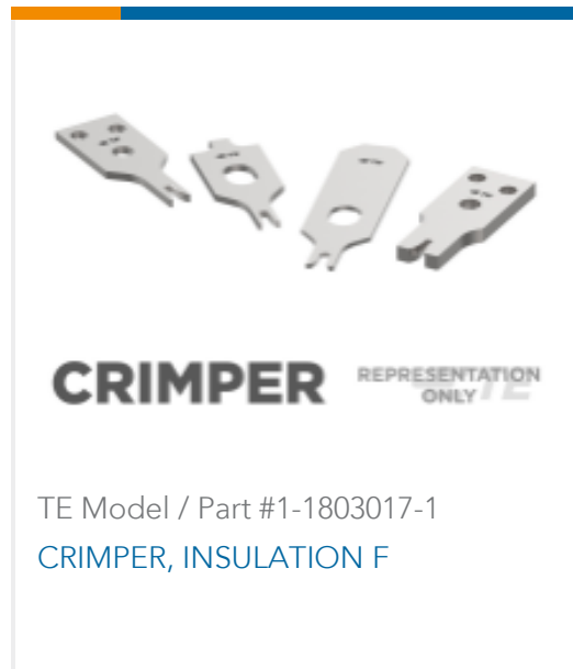
CRIMPER REPRESENTATION ONLY TE Model / Part #1-1803017-1 CRIMPER, INSULATION F