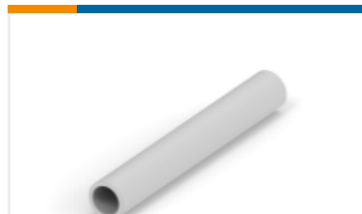
TE Model / Part #5054234003 Dual Wall DWP-125 Stick HS Tubing