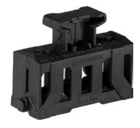
ESO 10.3x38 Fuse Inserter/Extractor with Cover Function for 10.3x38 mm Fuses in Clips, Patent Pending