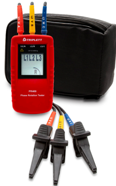
Motor and Phase Rotation Tester