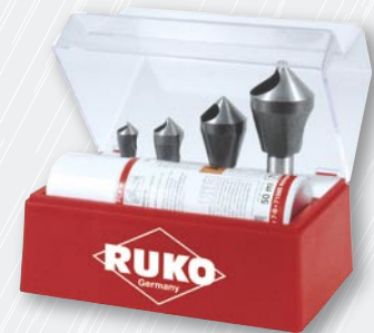
No. 102 310 E