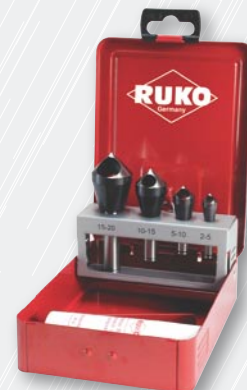
No. 102 312 E