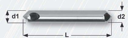
No. 102 300 E