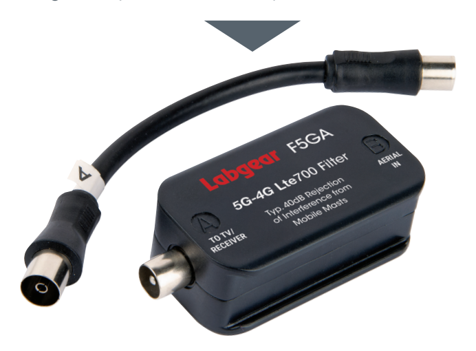
F5GA Indoor 4G-5G Filter with Coax Connections

Easy to install in-line filter with coax connections, supplied with a short coax cable for direct connection to the TV. Ideal for non technical installers. Compact plastic housing clearly labelled for foolproof installation