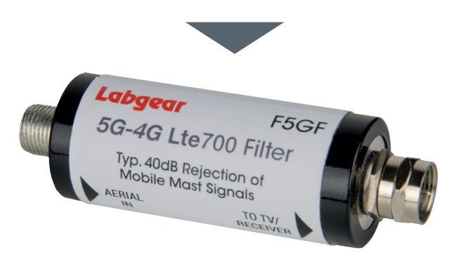
F5GF Indoor 4G-5G Filter with F Connections

Compact barrel filter with F connections ideal for indoor in-line connection at any convenient point between aerial and TV. With metal housing female F connector input male F connector output.