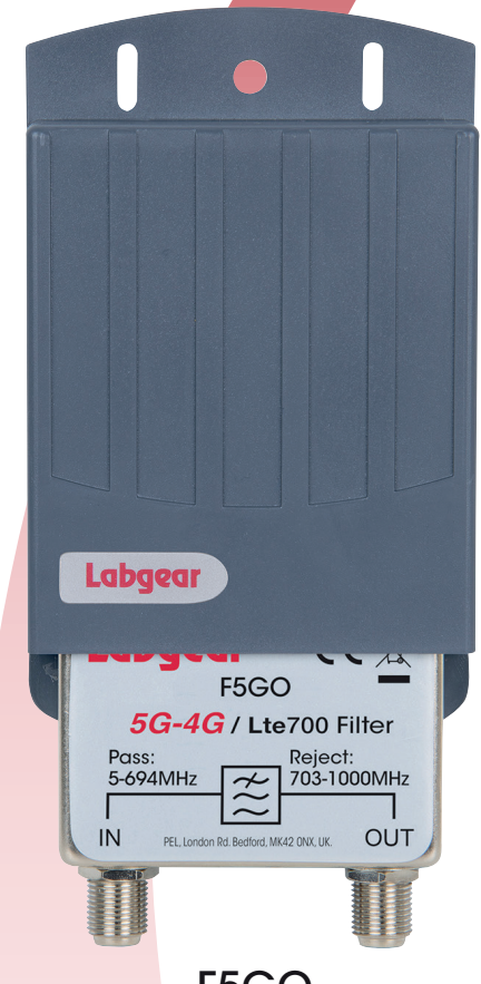
F5GO Masthead Outdoor 4G-5G Filter with F Connections