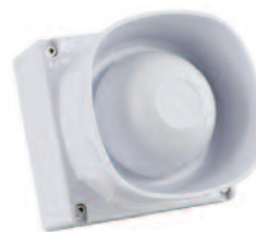
WP version white