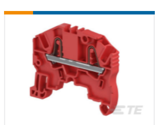
TE Model / Part #1SNK705062R0000 ZK2.5-RD