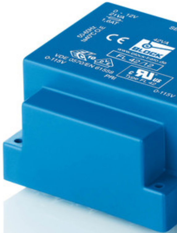
Picture shows FL 42/12