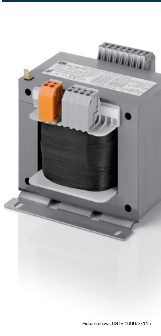
Picture shows USTE 1000/2x115