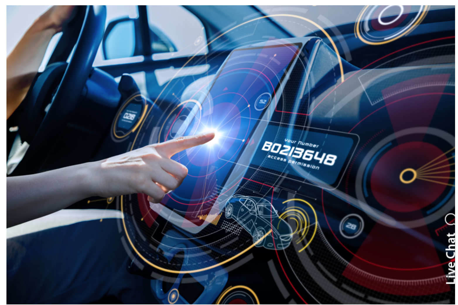
Figure 1. Automotive displays are getting bigger and sharper, delivering critical driving and road condition information that makes compliance with functional safety standards critical.

management ICs (PMICs) in order to produce large, razor-sharpinghickedisplayse Figure of bookies. Learn More