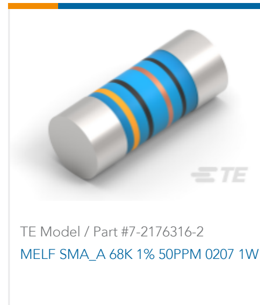
TE Model / Part #7-2176316-2 MELF SMA_A 68K 1% 50PPM 0207 1W