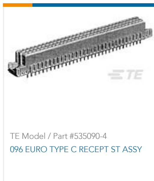
TE Model / Part #535090-4 096 EURO TYPE C RECEPT ST ASSY