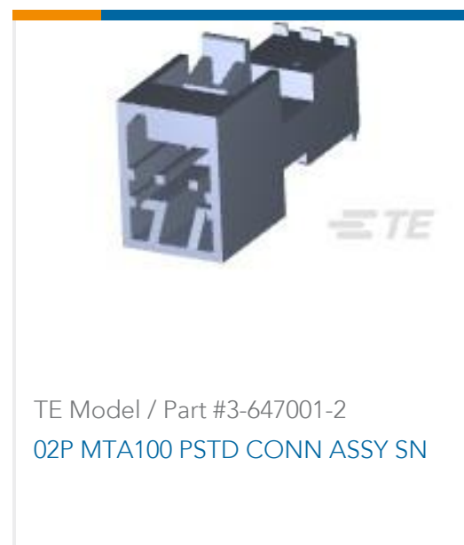
TE Model / Part #3-647001-2 02P MTA100 PSTD CONN ASSY SN