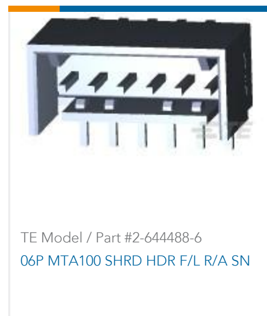
TE Model / Part #2-644488-6 06P MTA100 SHRD HDR F/L R/A SN