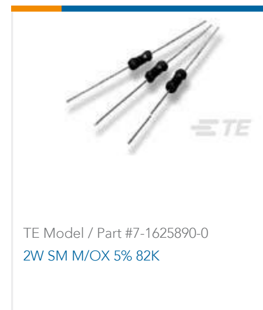
TE Model / Part #7-1625890-0 2W SM M/OX 5% 82K