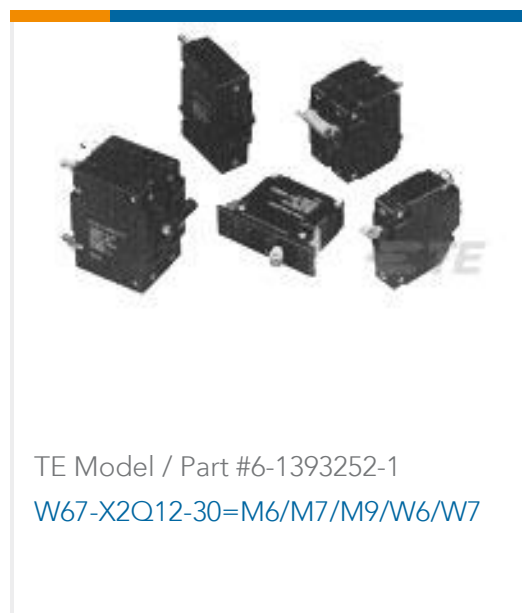
TE Model / Part #6-1393252-1 W67-X2Q12-30=M6/M7/M9/W6/W7