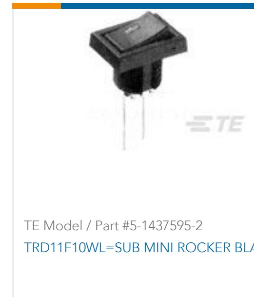
TE Model / Part #5-1437595-2 TRD11F10WL=SUB MINI ROCKER BLA