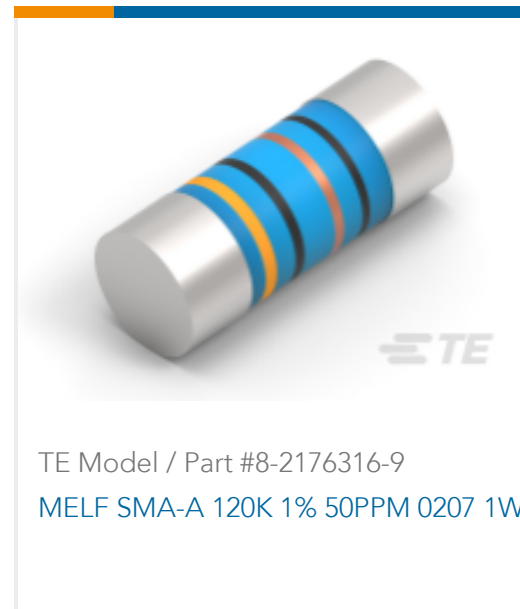
TE Model / Part #8-2176316-9 MELF SMA-A 120K 1% 50PPM 0207 1W