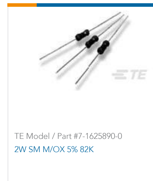
TE Model / Part #7-1625890-0 2W SM M/OX 5% 82K