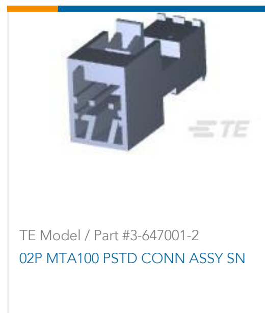
TE Model / Part #3-647001-2 02P MTA100 PSTD CONN ASSY SN