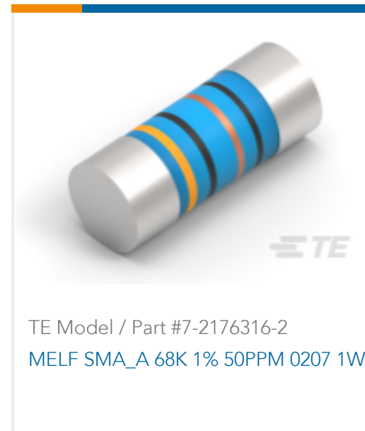
TE Model / Part #7-2176316-2 MELF SMA_A 68K 1% 50PPM 0207 1W