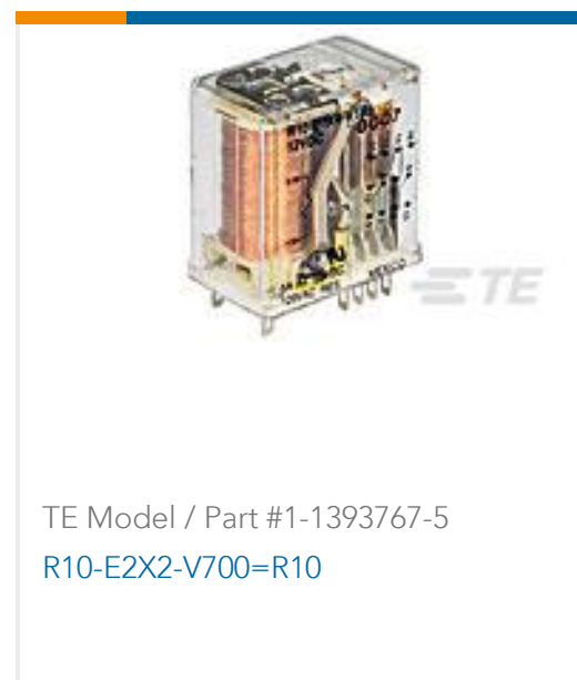
TE Model / Part #1-1393767-5 R10-E2X2-V700=R10