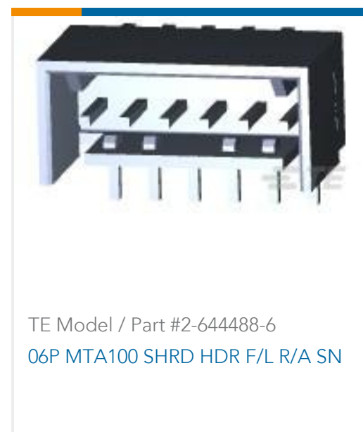
TE Model / Part #2-644488-6 06P MTA100 SHRD HDR F/L R/A SN