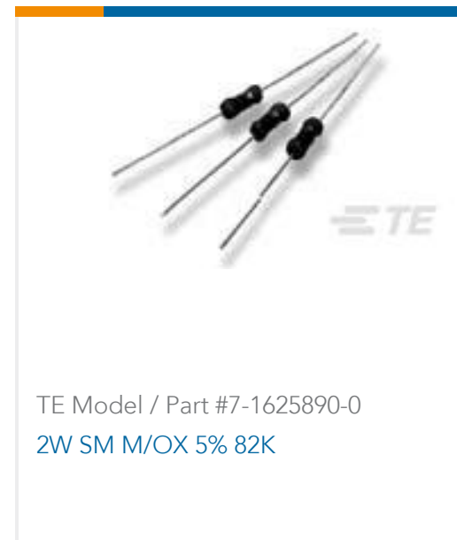
TE Model / Part #7-1625890-0 2W SM M/OX 5% 82K