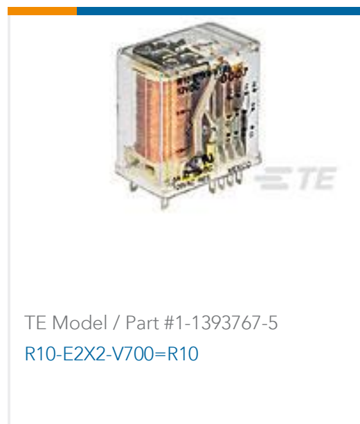
TE Model / Part #1-1393767-5 R10-E2X2-V700=R10