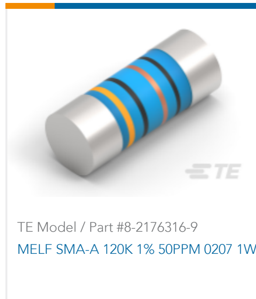
TE Model / Part #8-2176316-9 MELF SMA-A 120K 1% 50PPM 0207 1W