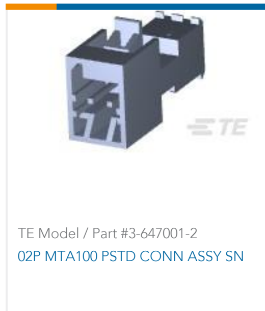
TE Model / Part #3-647001-2 02P MTA100 PSTD CONN ASSY SN