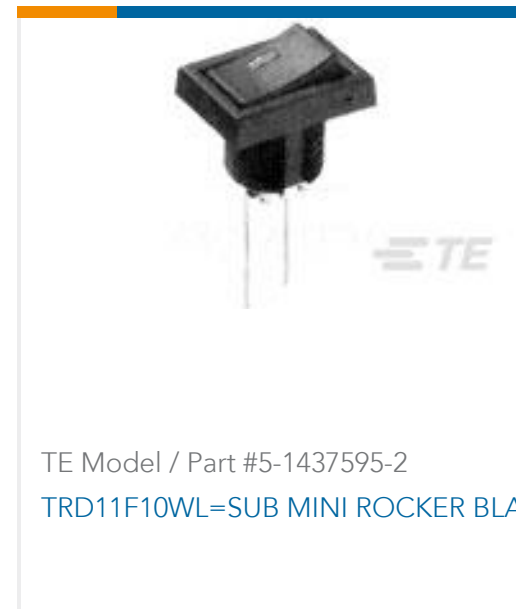
TE Model / Part #5-1437595-2 TRD11F10WL=SUB MINI ROCKER BLA