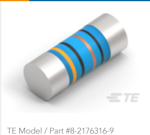
MELF SMA-A 120K 1% 50PPM 0207 1W