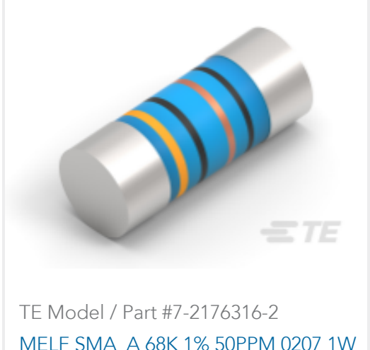
MELF SMA_A 68K 1% 50PPM 0207 1W