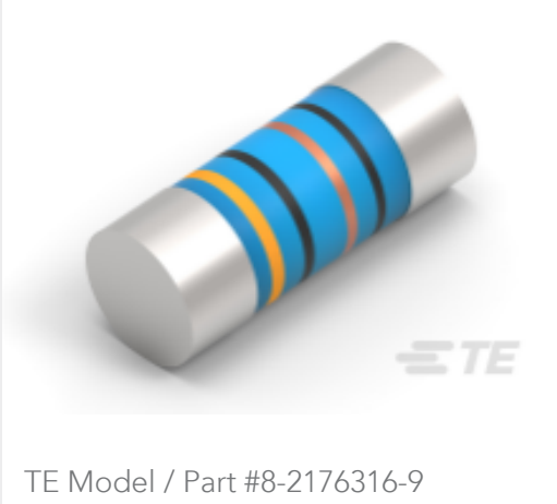
MELF SMA-A 120K 1% 50PPM 0207 1W