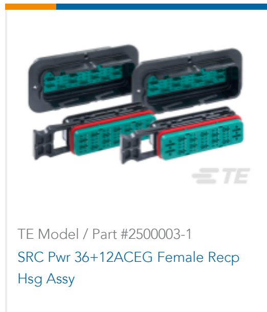
TE Model / Part #2500003-1 SRC Pwr 36+12ACEG Female Recp Hsg Assy