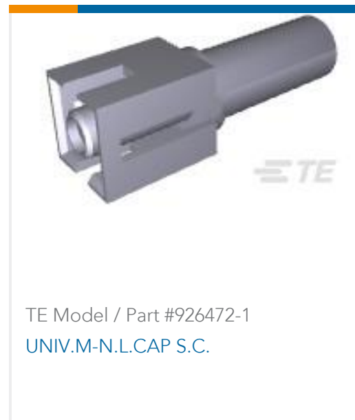
TE Model / Part #926472-1 UNIV.M-N.L.CAP S.C.