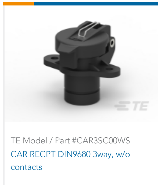
TE Model / Part #CAR3SC00WS CAR RECPT DIN9680 3way, w/o contacts