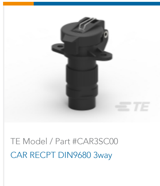
TE Model / Part #CAR3SC00 CAR RECPT DIN9680 3way