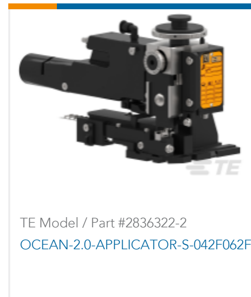
TE Model / Part #2836322-2 OCEAN-2.0-APPLICATOR-S-042F062F