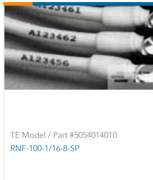
TE Model / Part #5054014010 RNF-100-1/16-8-SP