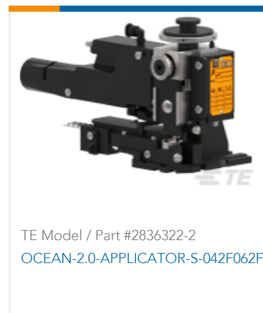
TE Model / Part #2836322-2 OCEAN-2.0-APPLICATOR-S-042F062F