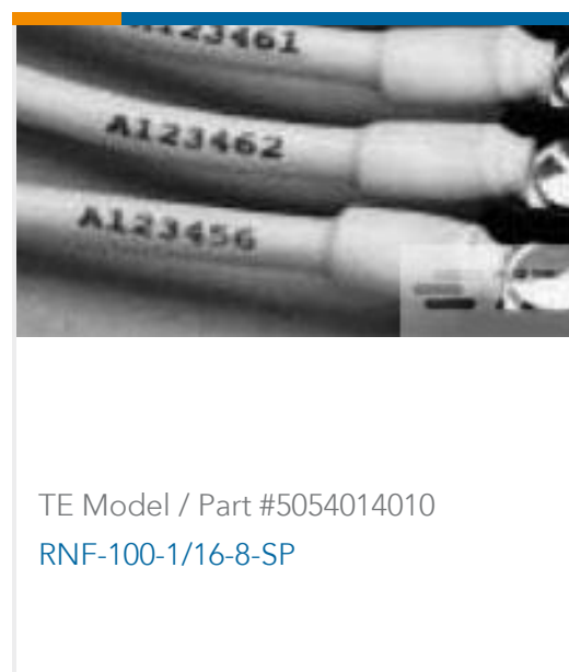
TE Model / Part #5054014010 RNF-100-1/16-8-SP