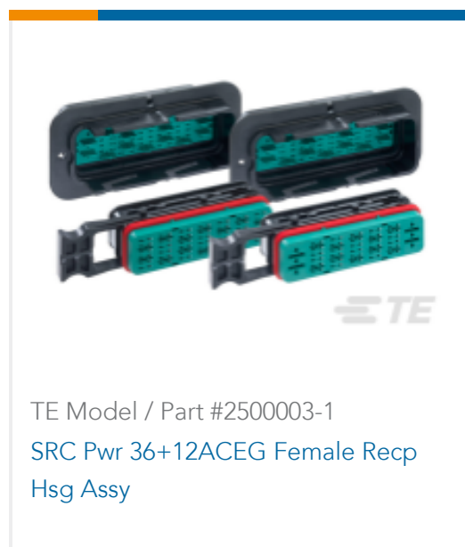
TE Model / Part #2500003-1 SRC Pwr 36+12ACEG Female Recp Hsg Assy