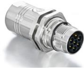
Contact Arrangement mating view

B KU A 863 NN 00 85 158A 000 B K A 863 N 00 85 158A 000