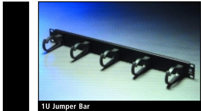
1U Jumper Bar

Mounts onto a standard 19" rack to provide cable management for patchcords.