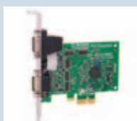
PX-313: PCIe 2xRS422/485 1MBaud