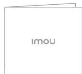
Quick Start Guide x1