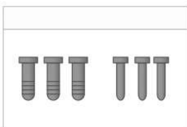
Screw package x6