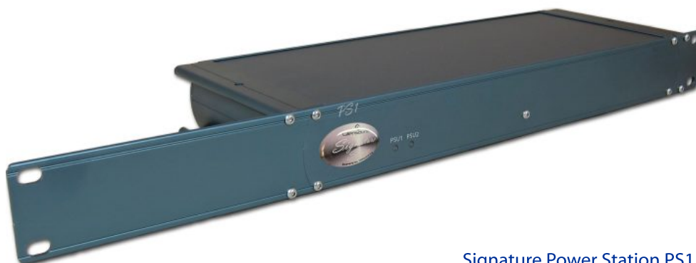
Signature Power Station PS1