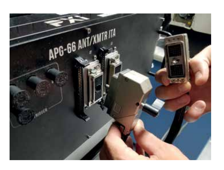
Figure 1: The cam in this test rack is easy to engage with the lever. For tight spaces, the lever can be replaced to move the cam. Another option is a self-actuated cam that, for example can mate and unmate when a drawer is closed or opened. (Learn more at Duotechservices.com)