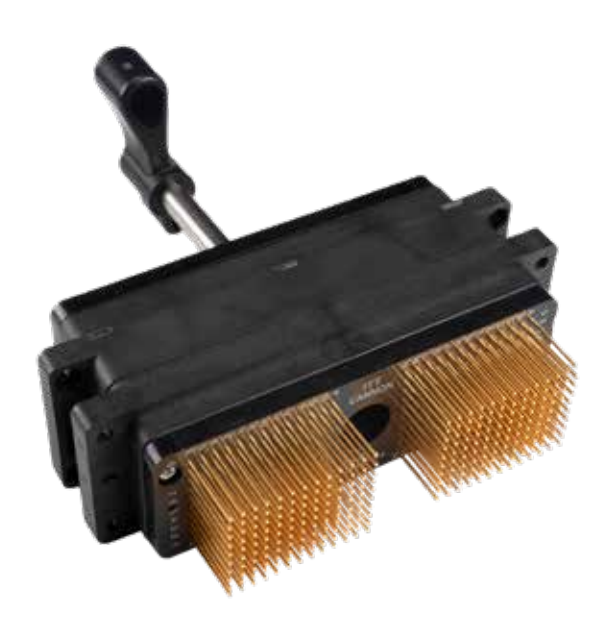
Figure 2: This 156-pin connector is part of the Cannon DL series of ZIF connectors. The cam in the center is the basis for zero force insertion. Single-handed actuation makes it easy to mate. A broad range of pin count, size, materials, and performance options are available for finding the exact choice.

When dealing with high pin counts and unique test requirements, ITT Cannon ZIF connectors can be configured to suppress unwanted signals generated from other signal or power wires housed in the same connector. For example, if you feed a mixture of 30 signals and power sources into ITT's DLM ZIF 60-pin connector, crosstalk can be addressed by using the 30 unused connections as grounding paths. Grounded wires can effectively shield signal-carrying wires from interference generated by power wires, even if they are all housed in the same connector. ITT Cannon's DLM-, DLP-, and QLC-series connectors also include an EMI/RFI shield-locking feature that helps deliver exacting performance requirements.