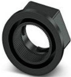
Photovoltaic connector, Range of articles: SUNCLIX, Screw connection, number of positions: 0

Please be informed that the data shown in this PDF Document is generated from our Online Catalog. Please find the complete data in the user's documentation. Our General Terms of Use for Downloads are valid ( http://phoenixcontact.com/download )