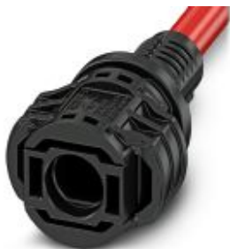
Photovoltaic connector, Range of articles: SUNCLIX, Photovoltaic connector, housing material: PPE, color: black, Connection method: Crimp, Type of contact: Pin

Please be informed that the data shown in this PDF Document is generated from our Online Catalog. Please find the complete data in the user's documentation. Our General Terms of Use for Downloads are valid ( http://phoenixcontact.com/download )