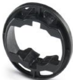
Photovoltaic connector, Spacer, housing material: PA 6

Please be informed that the data shown in this PDF Document is generated from our Online Catalog. Please find the complete data in the user's documentation. Our General Terms of Use for Downloads are valid ( http://phoenixcontact.com/download )