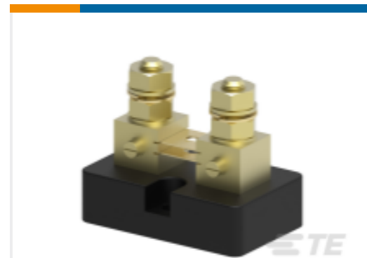
TE Part #CG5554-000 CI-TM8050