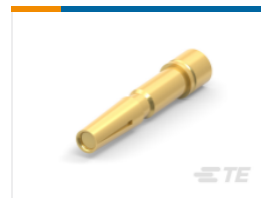
TE Part #60-0070-011-000 CONTACT SOCKET 1,5 MM