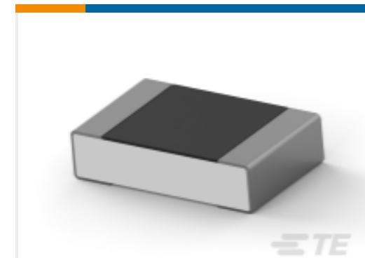
TE Part #4-2176374-8 RQ 0805 332R 0.1% 10PPM 1K RL