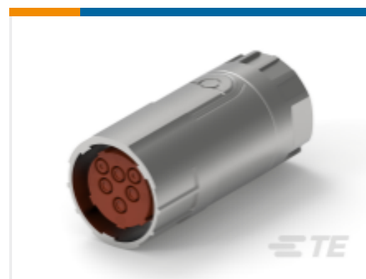
TE Part #CSA263N00260020000 940 PLUG, SPEEDTEC