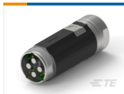
TE Part #DKA002N00740001000 958 EXTENSION