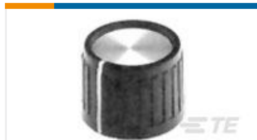
TE Part #6-1437624-6 PKG60B1/8=KNOB PLASTIC BLK 1/8