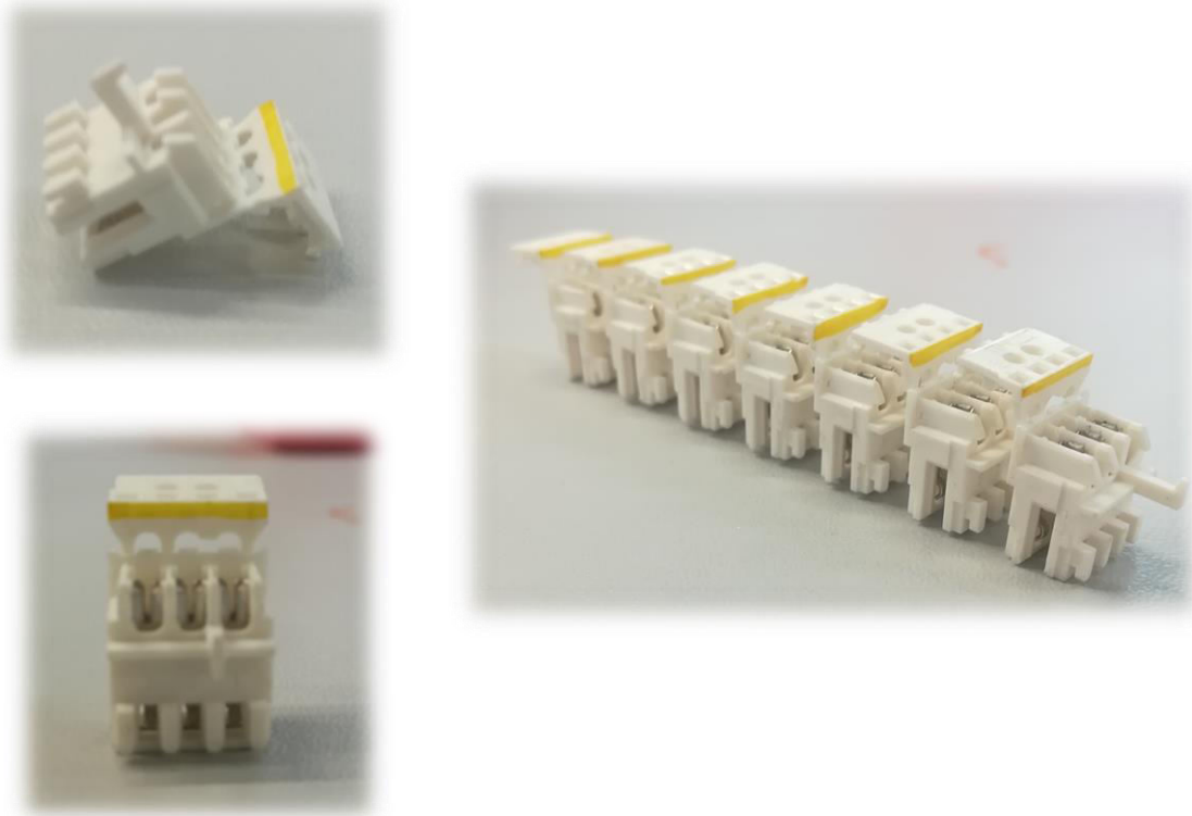
Examples without polarization color code