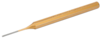
6 mm Cylindrical Drift Punch with Octagonal Shank and Lacquered Copper Finish 150 mm 3734-6