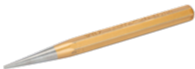
6 mm Drift Punch with Octagonal Shank and Lacquered Copper Finish 120 mm 3733-6