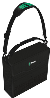
Wera 2go 2 05004351001 1 x 3 pieces