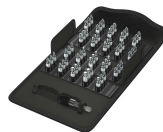
Bit-Safe 61 Wood 1 05057442001 1 x 61 pieces 05057442001 1 x 61 pieces 05057442001 1 x 61 pieces 05057442001 1 x 61 pieces