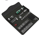
Kraftform Kompakt H1 Holz 05135939001 1) 1 x 41 pieces 05135939001 1) 1 x 41 pieces 05135939001 1) 1 x 41 pieces 05135939001 1) 1 x 41 pieces 05135939001 1) 1 x 41 pieces 05135939001 1) 1 x 41 pieces 05135939001 1) 1 x 41 pieces 05135939001 1) 1 x 41 pieces 05135939001 1) 1 x 41 pieces 05135939001 1) 1 x 41 pieces

1) Product not available in the USA and Canada.