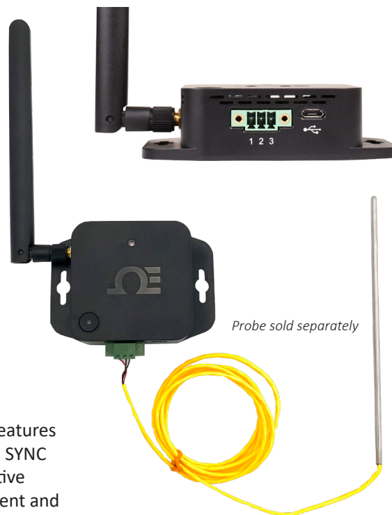
Probe sold separately

Layer N SS-002 Smart Sensors provide an external 3-wire RTD, thermocouple, or contact closure solution in addition to the built in suite of precision internal sensing elements that come standard with the SS-001 to accurately measure environmental conditions for a wide range of applications.