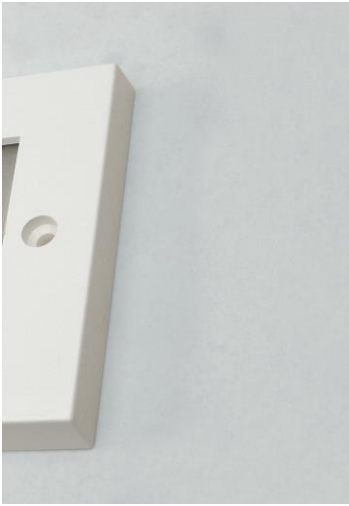
Plate sits properly flush to the wall with no small gaps at the sides caused by brush module jutting out. Our plate does not use a module but a built-in brush as shown below