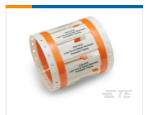
TE Part #EC9896-000 ZHD-SCE LFH & FLUID RESISTANT SLEEVES