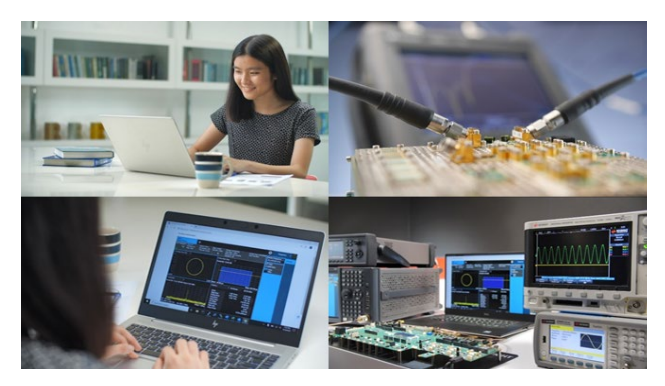
Figure 2. Shift the lab learning experience online with end-to-end remote lab solution

The Keysight industry-ready remote access lab solution takes remote learning to the next level of digital transformation, moving you beyond simulation and theory to real-world experience - simply at a distance.