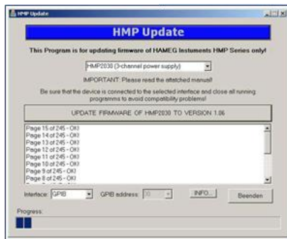
Fig.4: Update currently in process

The unit starts the update process immediately. Do not interrupt the power supply and do not switch off the HMP during update process is running. If the update program seems to be frozen, do not switch off the HMP anyway. The update is then running in the background and take about 10 minutes to succeed.