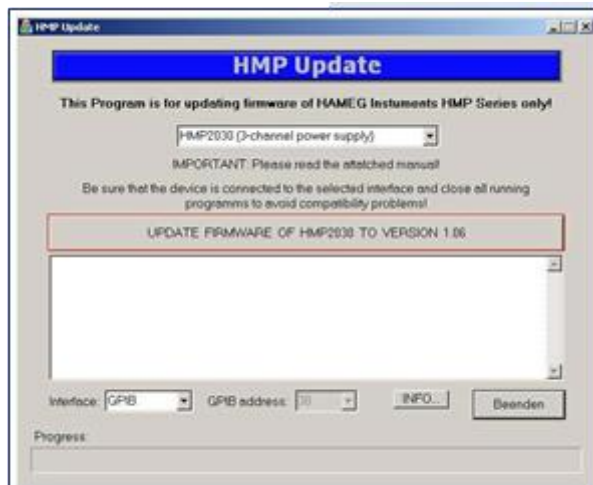
Fig.3: Start button for the update

The unit starts the update process immediately. Do not interrupt the power supply and do not switch off the HMP during update process is running. If the update program seems to be frozen, do not switch off the HMP anyway. The update is then running in the background and take about 10 minutes to succeed.