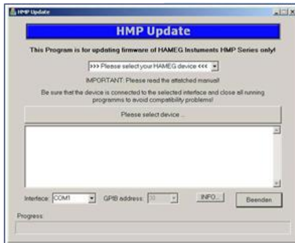
Fig.1: Window of the HMP update program