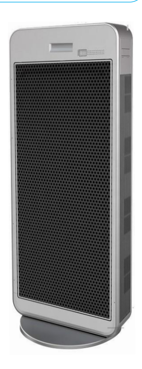
Floor Stand NOT Included, Order AXP-BASE if Required

Air Conditioning Centre is a registered trademark of Martin Industries Ltd. E&OE. Registered in England & Wales Co. No. 05436428