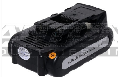
hover to zoom; click to enlarge

Chemistry: Lithium Ion (ICR/CGR/LIR) Voltage: 14.4 Capacity: 1500mAh (21.6Wh) Measurements: 5.1" x 3.5" x 1.9" 129.54mm x 88.90mm x 48.26mm