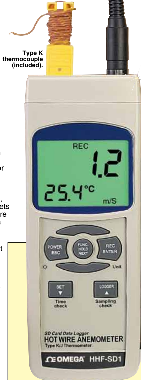
Type K thermocouple (included).

This model includes a free 1 m (40") Type K insulated beaded wire thermocouple with subminiature connector and wire spool caddy. Order a Spare! Model No. SC-GG-K-30-36