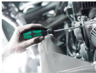
Kraftform Screwdrivers Series 300