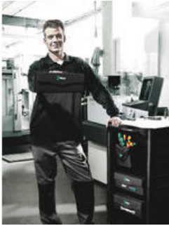
Wera 2go 3 – The inside packer