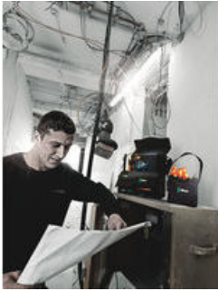
Wera 2go 4 Tool Quiver