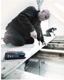
Impaktor holder with ring magnet

Impaktor technology for an above-average service life even under extreme demands