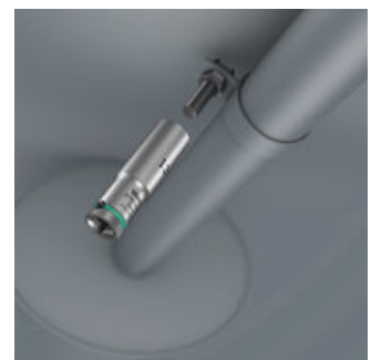
Due to the long design of the socket, screwdriving can also be achieved in small spaces. Fittings with protruding threaded rods are often also possible.