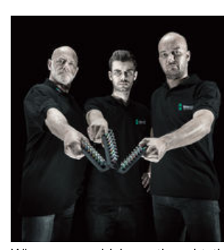
Whoever would have thought that the storage of sockets could be completely revolutionised and that someone could come up with a stylish belt with securely attached sockets that can still be easily removed.