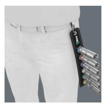
The robust textile belt can be secured to a belt loop or pocket by means of the snap hook.