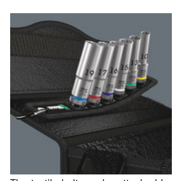
The textile belt can be attached by means of the nonwoven reverse side and the hook and loop strips e.g. to a wall, shelf, tool trolley and to the Wera 2go tool transport system.