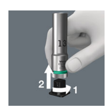
The all new smooth turning mechanism guarantees both secure and rattle-free storage, yet allows easy removal of the tool.