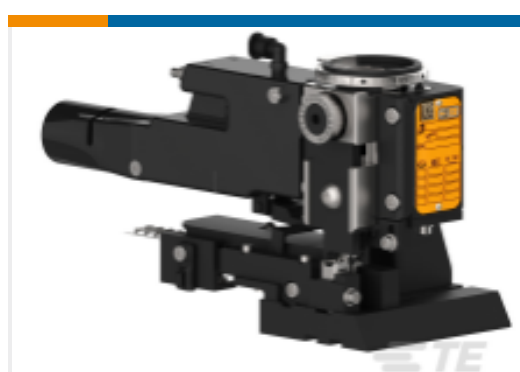
TE Part # 2-2266117-2 OCEAN-2.0-APPLICATOR-S-069F0900A