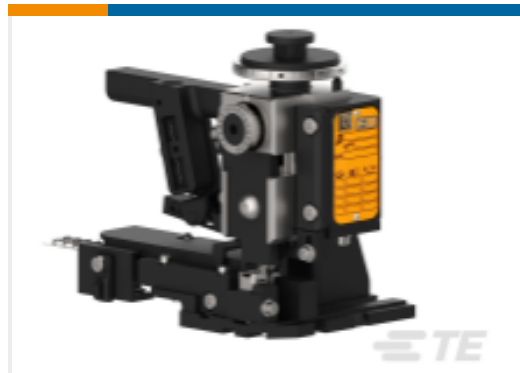
TE Part # 2266102-1 OCEAN_2.0_APPLICATOR-S-090F0900