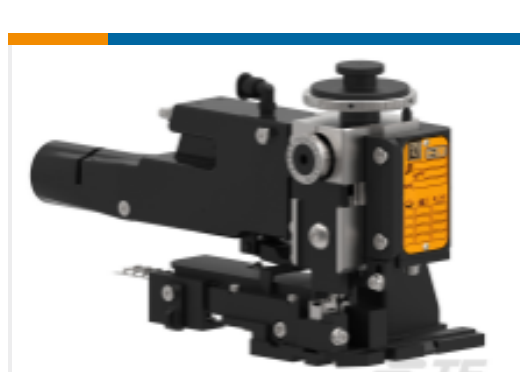
TE Part # 2266114-2 OCEAN-2.0-APPLICATOR-S-103F0900A