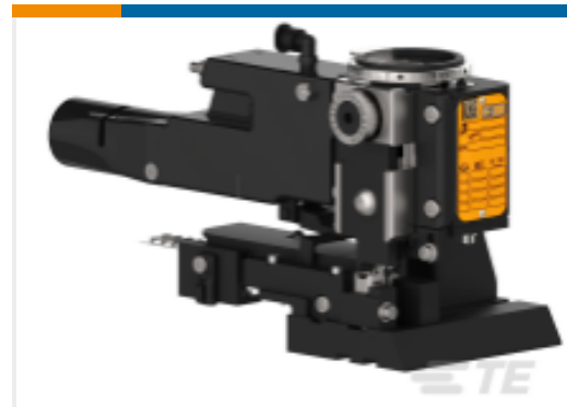
TE Part # 2-2151016-2 OCEAN_2.0_APPLICATOR-S-062F0900A