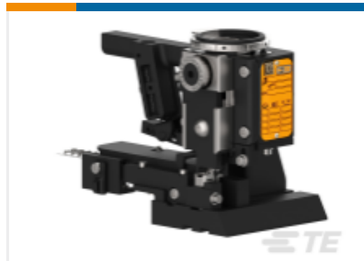
TE Part # 2-2151016-1 OCEAN_2.0_APPLICATOR-S-062F0900