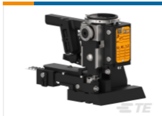
TE Part # 2-2266114-1 OCEAN-2.0-APPLICATOR-S-103F0900