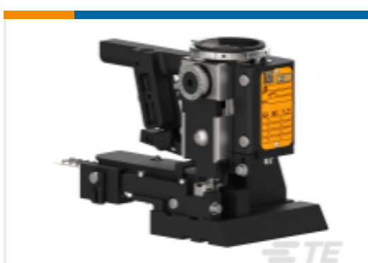
TE Part # 2-2266117-1 OCEAN-2.0-APPLICATOR-S-069F0900