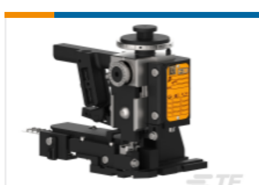
TE Part # 2151016-1 OCEAN_2.0_APPLICATOR-S-062F0900