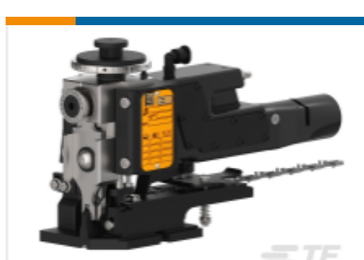
TE Part # 2150343-2 OCEAN-2.0-APPLICATOR-E-080F0900A