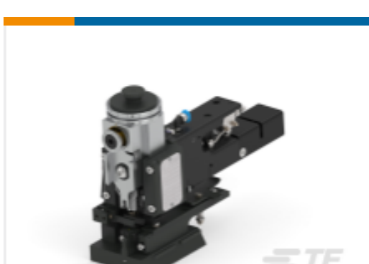
TE Part # 2150343-1 OCEAN-2.0-APPLICATOR-E-080F0900