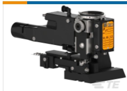
TE Part # 2-2266114-2 OCEAN-2.0-APPLICATOR-S-103F0900A