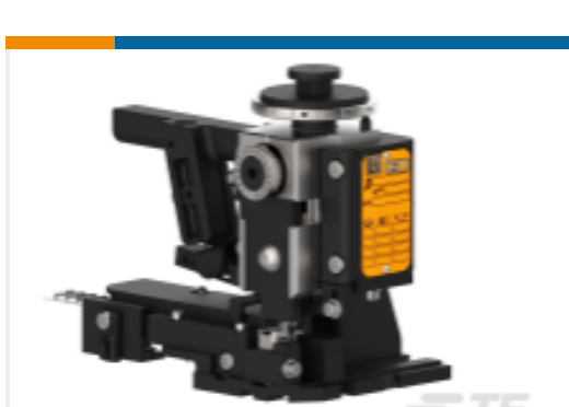
TE Part # 2266114-1 OCEAN-2.0-APPLICATOR-S-103F0900