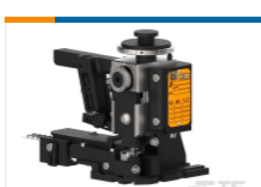
TE Part # 2266117-1 OCEAN-2.0-APPLICATOR-S-069F0900