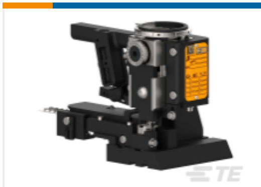
TE Part # 2-2266102-1 OCEAN_2.0_APPLICATOR-S-090F0900