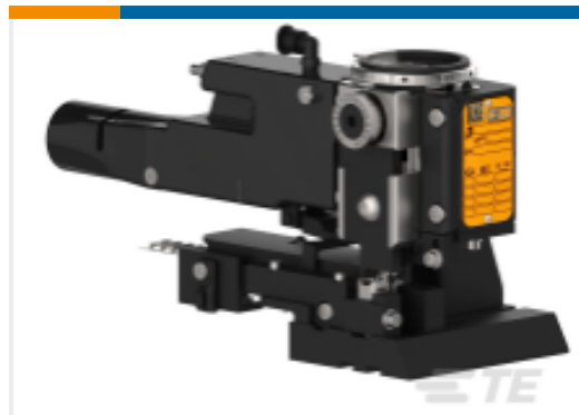
TE Part # 2-2266102-2 OCEAN_2.0_APPLICATOR-S-090F0900A