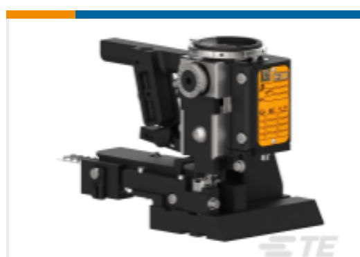
TE Part # 2-2836074-1 OCEAN_2.0_APPLICATOR-S-062F0900