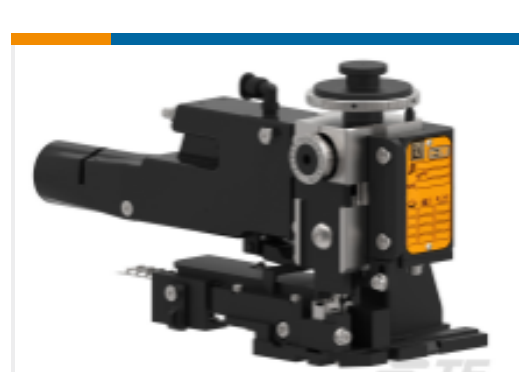
TE Part # 2266117-2 OCEAN-2.0-APPLICATOR-S-069F0900A