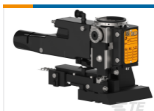
TE Part # 2-2836074-2 OCEAN_2.0_APPLICATOR-S-062F0900