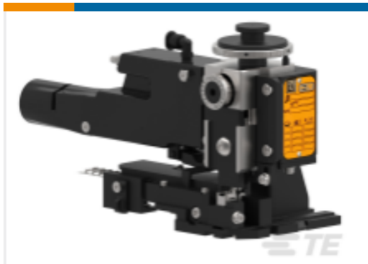
TE Part # 2151016-2 OCEAN_2.0_APPLICATOR-S-062F0900A