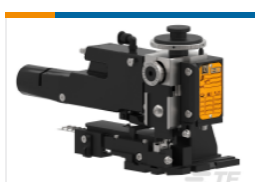
TE Part # 2266102-2 OCEAN_2.0_APPLICATOR-S-090F0900A